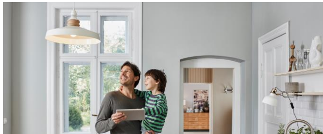
Lighting, switches and controls