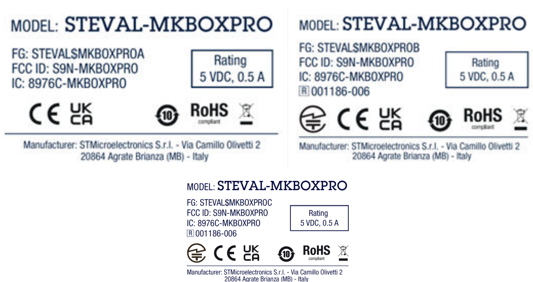
Figure 2. Label visible on back of the box